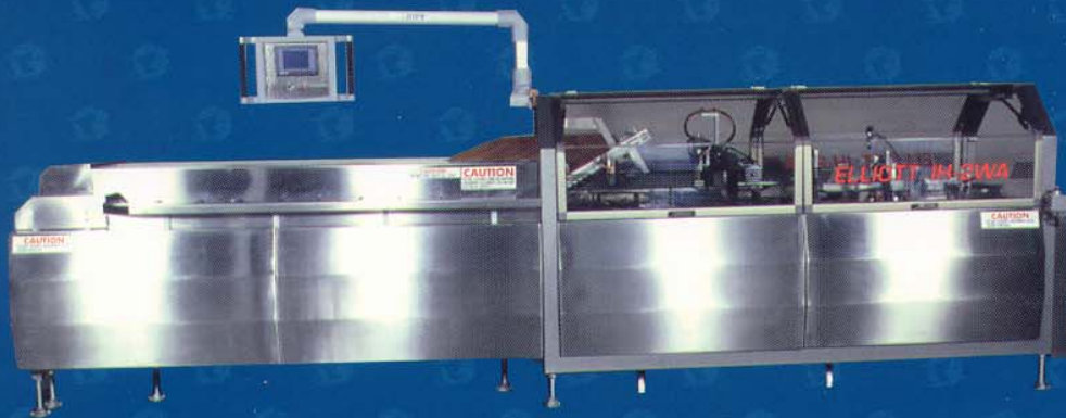
Shown with extended in-feed and 6' power carton magazine.